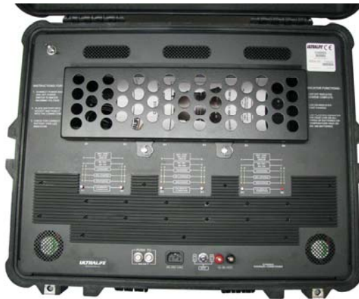
Figure 2: CH0003 Charger (Front View)

The CH0003 is 635mm (25") L x 508mm (20") W x 229mm (9") D and weighs approximately 15kg (33 lbs.) Figure 2 shows the physical layout of the charger. The CH0003 consists of six charge modules, an AC to DC Power Module and a Control/Filter Board.