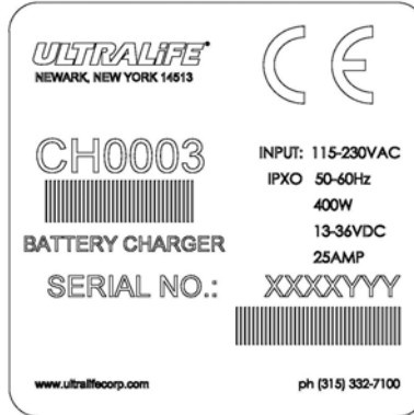
Figure 1: Name Plate